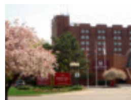
Crowne Plaza Cols. North

Overnight rooms have been reserved at a rate of $79.00 plus tax for Single/Double at the Crowne Plaza Columbus North , 6500 Doubletree Avenue, Columbus. To receive this rate, please identify yourself as a participant of the Ohio Ministries Convocation, by calling the hotel directly at 1/800-227-6963 or 614/885-1885. When you check out you would need to have your church Tax Exemption form in order to receive an exemption. Deadline for registration is 1/11/2010 . For directions, go to: